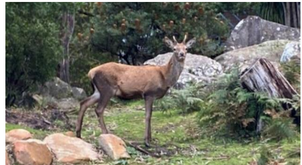
Introduced Red Deer

Parks Victoria has a legal obligation to control deer and goats on its estate and is one of the many partners delivering on this strategy.