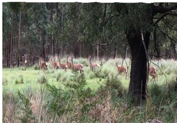
Red Deer in Grampians (Gariwerd) National Park

Parks Victoria encourages community members to report any sightings of deer and goats on private or public land through Feral Scan. Feral Scan is a free resource that anyone can use to record sightings of deer, report the damage (or problems) they cause, and record control actions. FeralScan