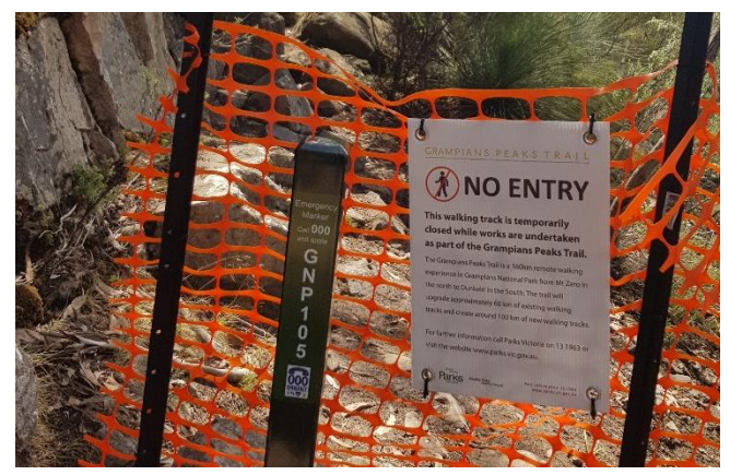
Above: Visitors are asked to observe closure signs.

Although some trails may appear finished there are more elements to be added, for example, signage for wayfinding, safety and emergencies. Trails will remain closed for safety of park visitors, workers and staff until ready to be used. There are trail closure signs installed at all access points and all park users are requested to comply with closures.