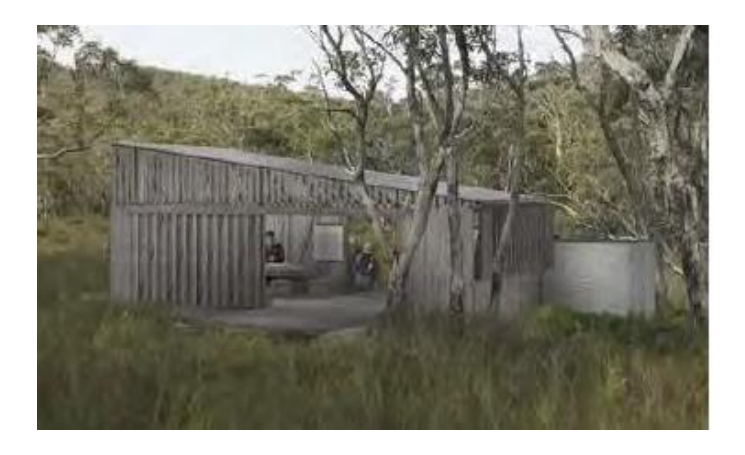
Above: Illustrative design of communal shelter.