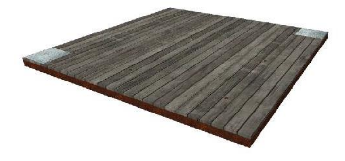
Above: Illustrative design of raised timber tent pads.