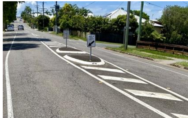
(Example photo, credit to Logan City Council)

Work hours will be Monday to Friday - 7am to 6pm and Saturday - 9am to 3pm. Work hours will be reduced on school days to minimise disruption for school drop-off and pickup.