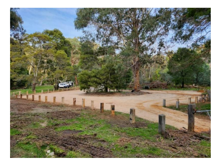
Pictured above: Improved Tipperary Springs car park