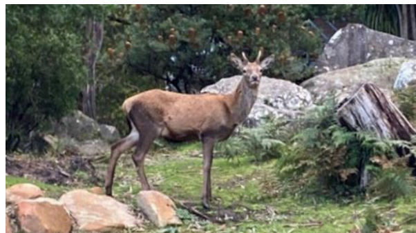
Introduced Red Deer

Parks Victoria has a legal obligation to control deer and goats on its estate and is one of the many partners delivering on this strategy.