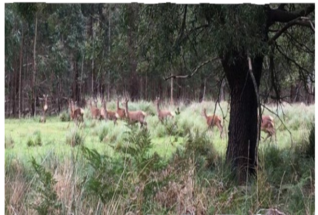
Red Deer in Grampians (Gariwerd) National Park

Yes. The aerial shoot will only be undertaken in the areas impacted by fire and currently closed to the public for safety reasons due to the damage from fire. No additional closures of visitor sites of campgrounds are being implemented.