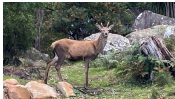
Introduced Red Deer

Foxes and feral cats prey on Grampians native animals such as the Brush-tailed Rock-wallaby, Long-nosed Potoroo, Southern Brown Bandicoot, Smoky Mouse, Heath Mouse, and Grampians Mountain Dragon. These native animals are now more exposed to predation due to the loss of vegetation cover because of the recent fires.