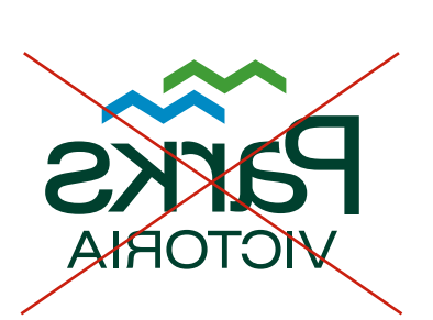
No reverse or spin animations