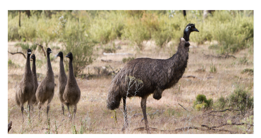
Heathy Forest and Woodland