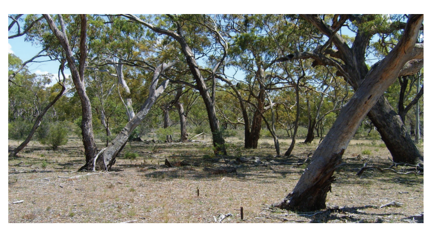
Herb Forest and Woodland