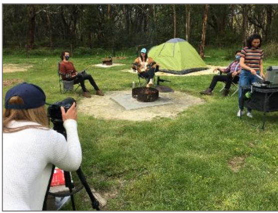
Above: Photo & video shoot; Great Otway National Park