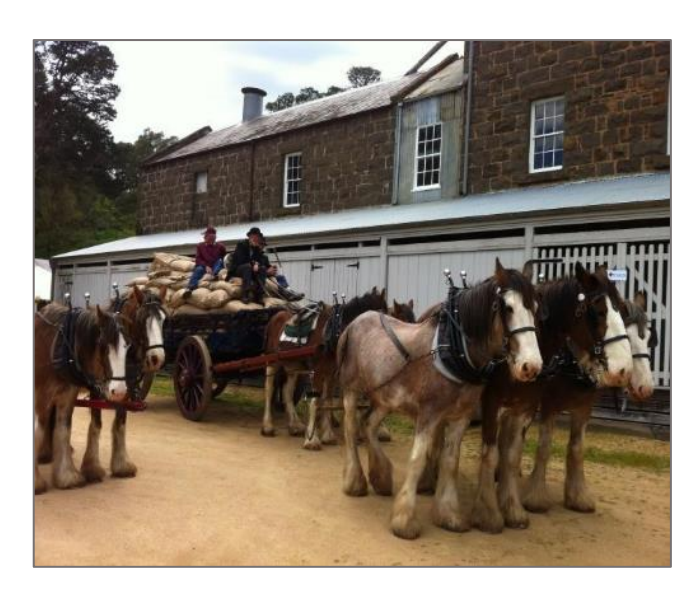
Above: Andersons Mill 150 Year Celebration

We welcome your feedback. If you would like to suggest improvements to this guide, or share with us case-studies of your sustainability initiatives, please provide feedback to us at <a href="mailto:events@parks.vic.gov.au">events@parks.vic.gov.au</a>