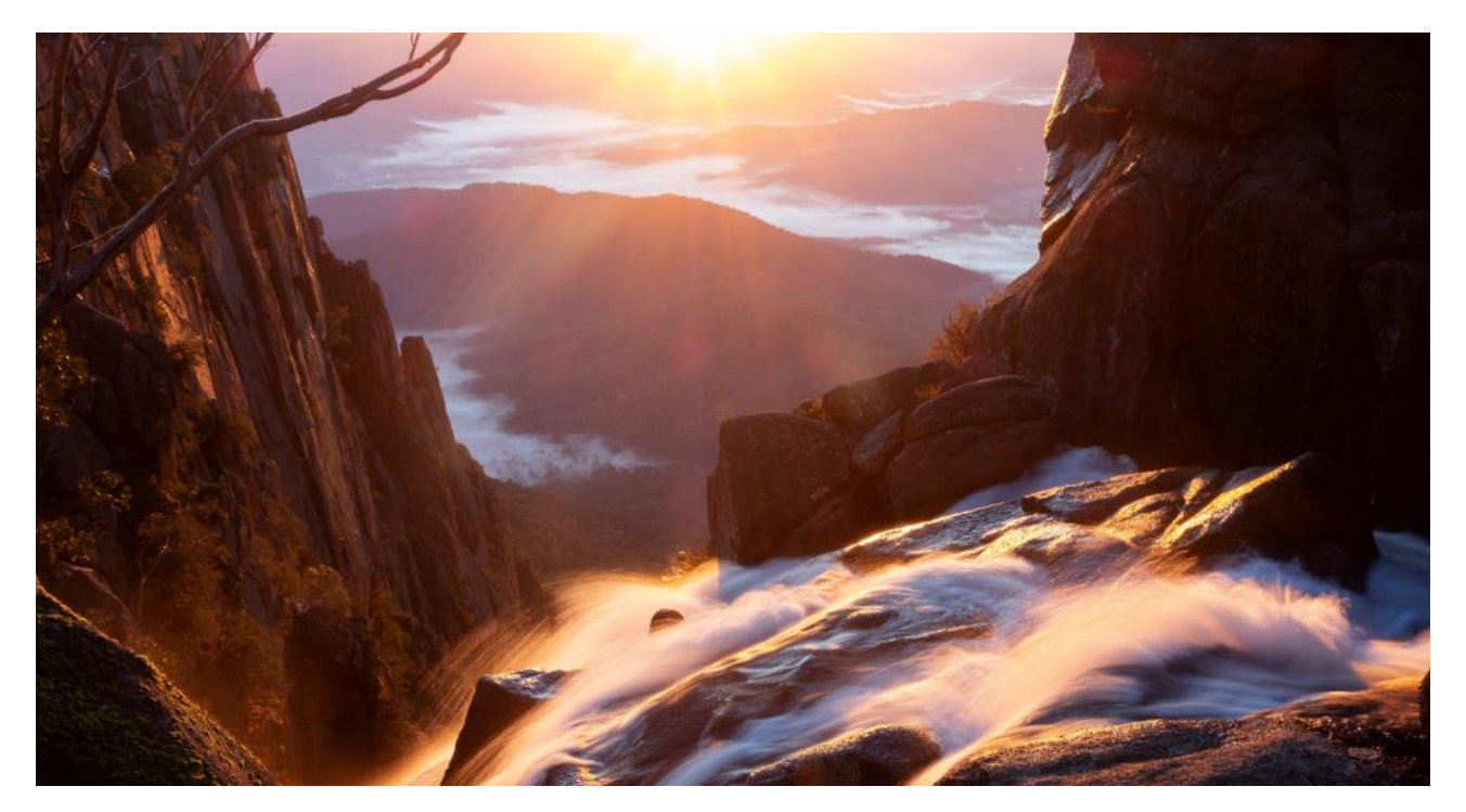
Above: Crystal Brook Falls, Mount Buffalo National Park