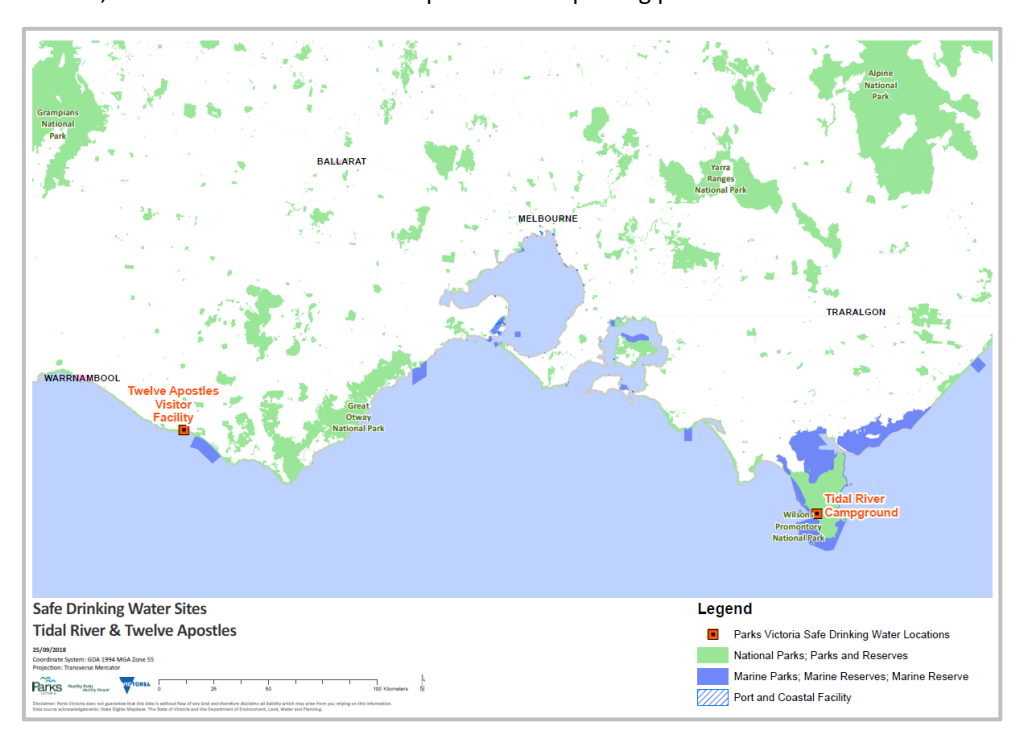
Figure 1.1 Parks Victoria Safe Drinking Water localities

Section 26 of the SDW Act requires that PV produce an annual drinking Water Quality Report for its two sites. The report must meet requirements set out in the SDW Act and SDW Regulations and include information on Parks Victoria's water supply systems and water quality performance for the financial year. The report is required to be submitted to the Department of Health (DH) by 31 October each year for the previous financial year and must be made public. This report has been prepared to comply with these requirements and covers the period from 1 July 2022 to 30 June 2023, which is referred to in this report as the reporting period.