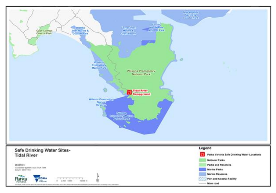
Figure 2.1 Location of Tidal River Campground, Wilsons Promontory National Park

Water usage at the site varies throughout the year based on visitor numbers. This variation in demand is managed operationally. A map of the location of the Tidal River Campground in the Wilsons Promontory National Park is shown in Figure 2.1.