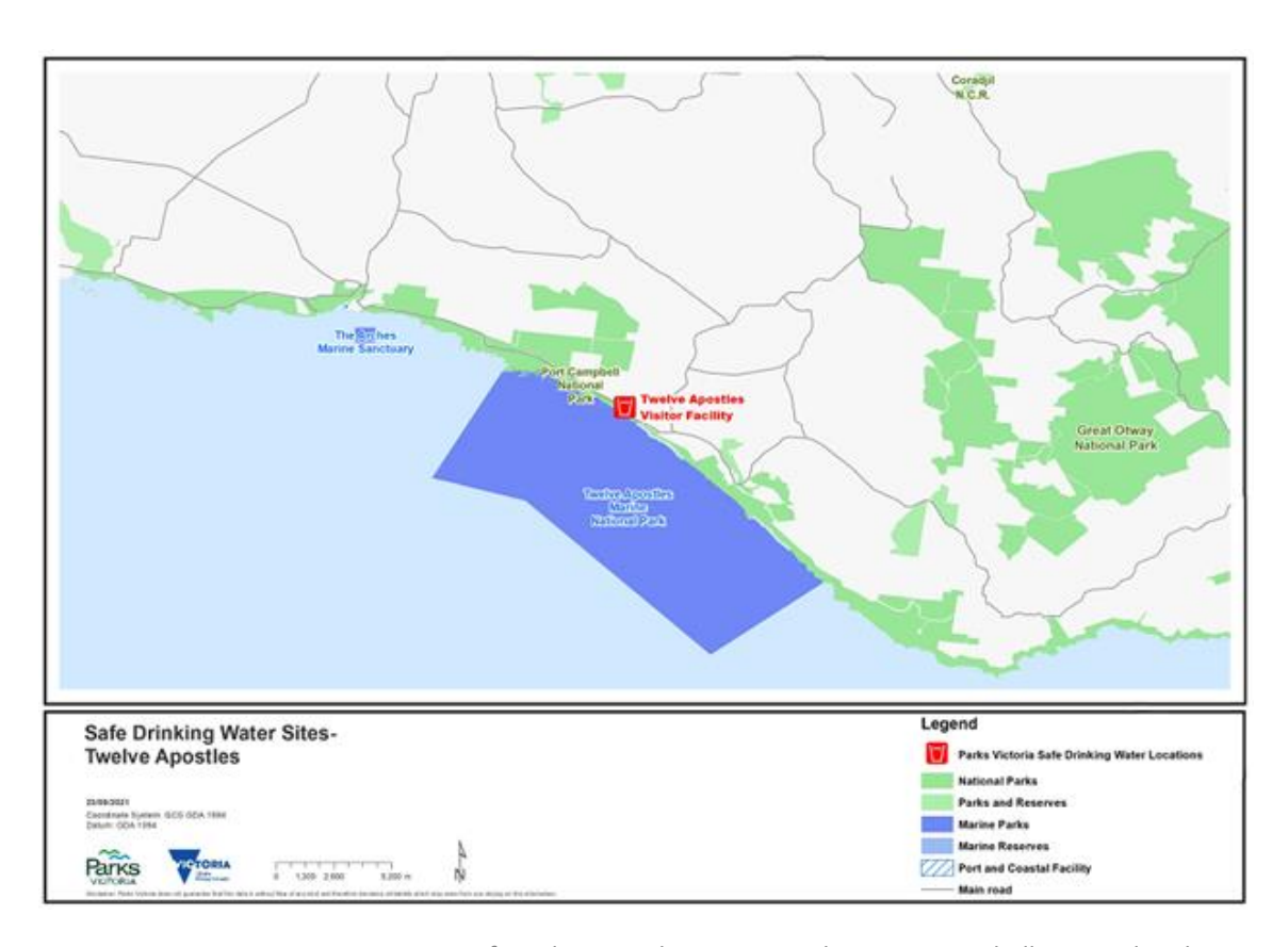
Figure 2.2 Location of Twelve Apostles Visitor Facility, Port Campbell National Park

Whilst PV has overarching responsibility and control of the site, PV has a contractual agreement in place with Wannon Water to maintain the Twelve Apostles water supply system in accordance with the Twelve Apostles Safe Drinking Water Risk Management Plan. Responsibilities include operational and compliance monitoring, asset maintenance, responding to water quality deviations and events, and reporting requirements. A map of the location of the Twelve Apostles Visitor Facility is shown in Figure 2.2.