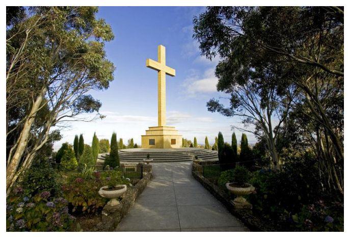
Mount Macedon Memorial Cross and heritage gardens, circa 2005

Visit the Mount Macedon Viewscape Project Page <a href="https://www.parks.vic.gov.au/projects/western-victoria/mount-macedon-viewscape">https://www.parks.vic.gov.au/projects/western-victoria/mount-macedon-viewscape</a>