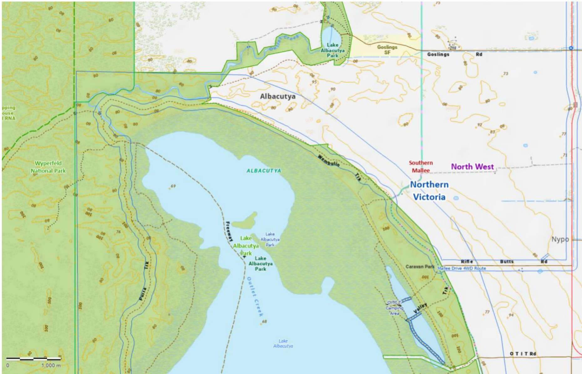
Map 1b Lake Albacutya Park – north (taken from Parks Victoria asset information management system)