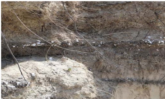
Aboriginal heritage sites are a key reason for protecting the dunes

Early European accounts noted permanent villages nearby, and large inter-tribal gatherings at Tarerer (Kellys Swamp) to celebrate and share in the bounty of the sea.