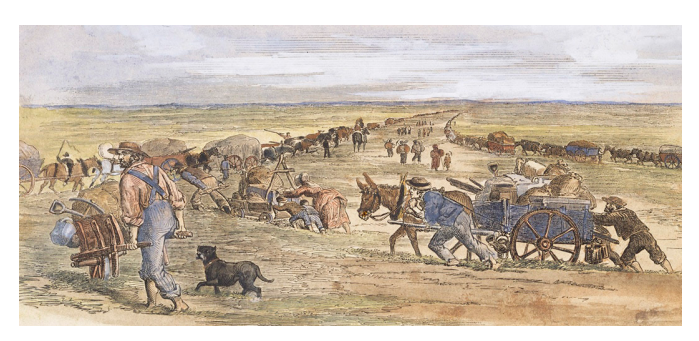
Adventurers travelling to the diggings through the Keilor Plains in 1853. Engraving with watercolour by J.A. Gilfillan.

The goldfields made such an extraordinary contribution to the state's success, that the Victorian Government set up a Board to decide who should be rewarded for discovering them.