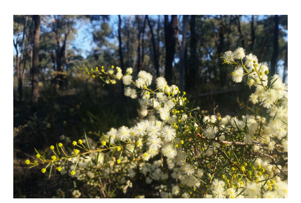
Spreading Wattle in Box-Ironbark Forest

Since European settlement, the Box-Ironbark forests and woodlands have been extensively cleared for agriculture, gold mining, urban development and timber. Today only 17 percent of the original Box-Ironbark vegetation of north central Victoria remains.