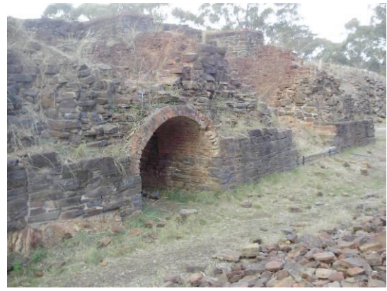
Quartz kilns at North British Mine

Located in and around Maldon township, Maldon Historic Area protects many relics of the gold mining era - abandoned shafts and tunnels, mullock heaps, quartz roasting kilns, stone walls, chimneys and machinery - as well as the Box and Ironbark forests once threatened by the constant demand for timber to feed steam boilers and shore up mine tunnels.