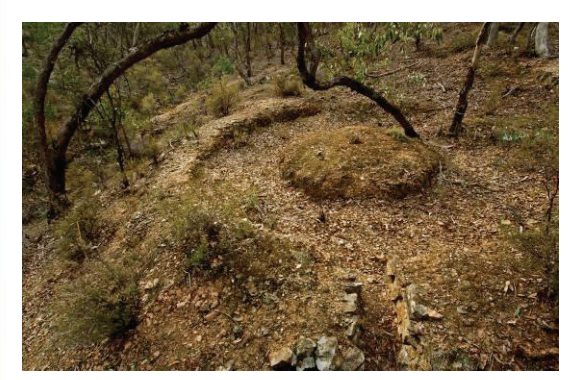
Remains of a puddler

Picnic areas are located at Butt's Reserve, North British Mine, South German Mine, Carman's Tunnel and Mt Tarrengower. Camping is permitted at Butt's Reserve, but there are few facilities. Bed and breakfast, self contained cottages, hotel and motel accommodation is available in Maldon. Caravan parks are located at Maldon, Welshmans Reef and Baringhup.