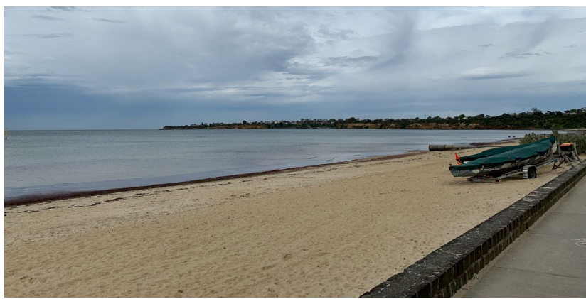
As the weather warms up, Mentone becomes a popular place to enjoy the beach. It's important people know where they can swim safely without risk of accidents with boats or other watercraft.