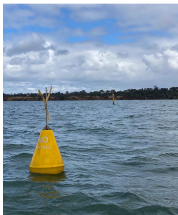
Yellow buoys indicate 'No Vessel' zone boundaries.