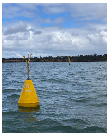
Yellow buoys indicate 'No Vessel' zone boundaries.