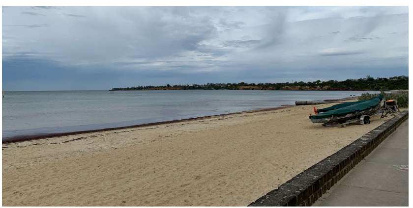
As the weather warms up, Mentone becomes a popular place to enjoy the beach. It's important people know where they can swim safely without risk of accidents with boats or other watercraft.