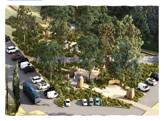
Photo 2 – Concept illustration of aerial view of Halls Gap (Budja Budja) trailhead.

The proposed <u>new trailhead in Halls Gap</u> will better connect the town to the mountains with a new track and boardwalk, gathering spaces, rock seating and signage. To stay informed about this project <u>sign up</u> for updates.