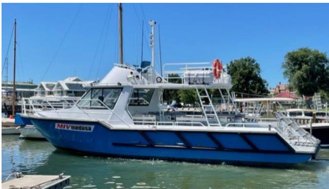
Support Vessel Medusa II