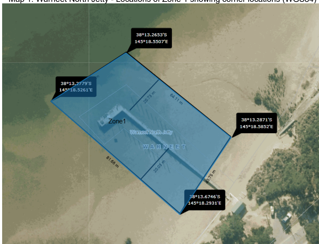
Map 1. Warneet North Jetty - Locations of Zone 1 showing corner locations (WGS84)