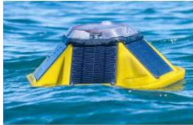
WAVE MONITORING BUOY